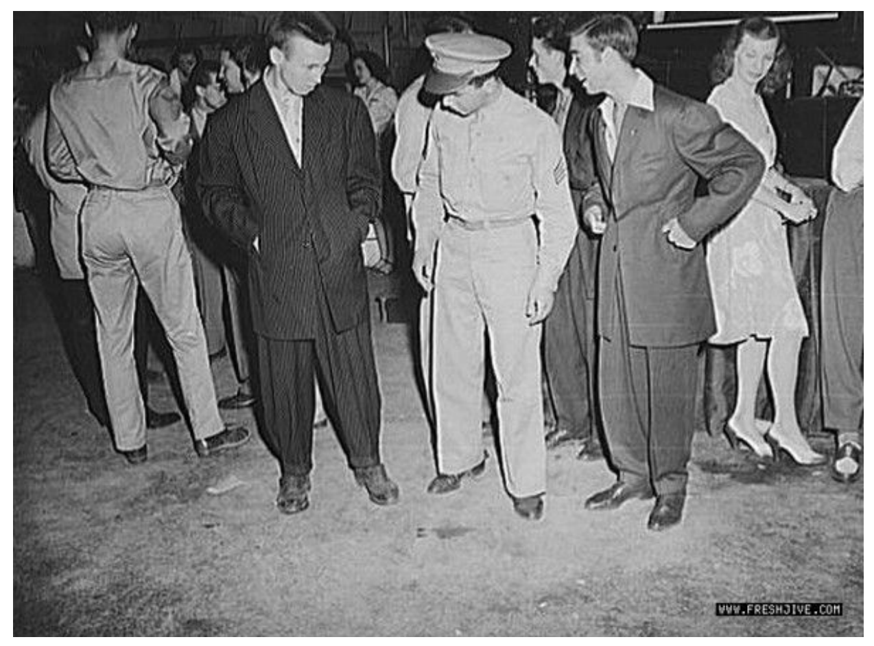
IMAGE 4