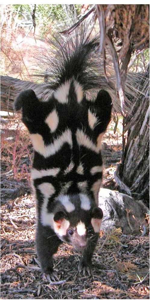
Spotted skunks walk on their front legs to look bigger.

You have a secret weapon to keep enemies away. You only use it after you try everything else. First, you