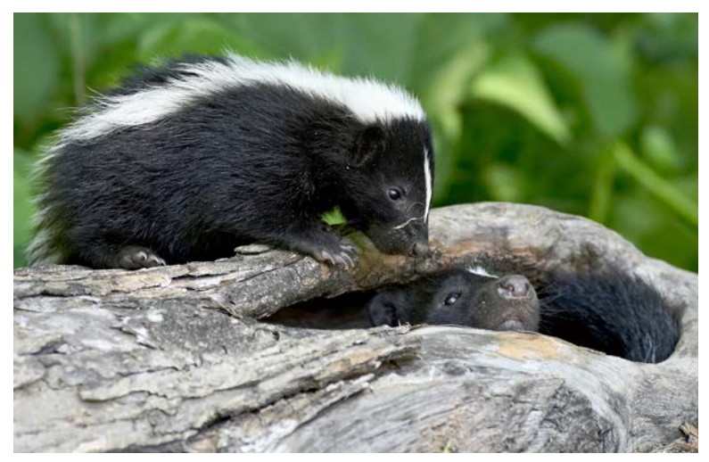
You are a striped skunk.