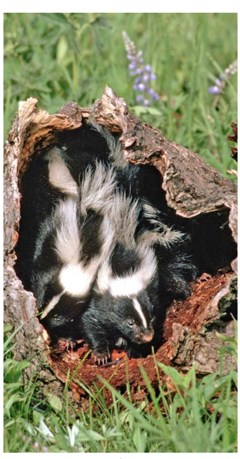
This hollow log is a perfect home for you.

You are careful not to spray musk around your home. You don't like your smell any more than other animals do!