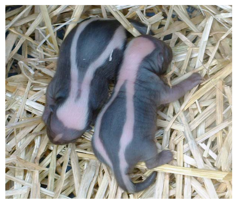
These skunk babies are less than a week old.

If you are a female skunk, you give birth to babies in the spring. The babies are called kits. You usually have five or six kits at one time. Your kits are born with skin that is black and white. Their skin has the same pattern of color that their fur will have someday.