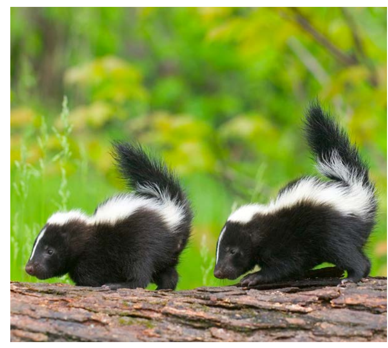
These kits are learning about the world around them.

You stay in your den with your kits for about six weeks. Like other mammals, you feed your babies milk so they will grow. Then you take your kits outside. You protect them from animals that might want to eat them. Your kits learn how to find food and stay safe. After nearly a year, they leave you to live alone.