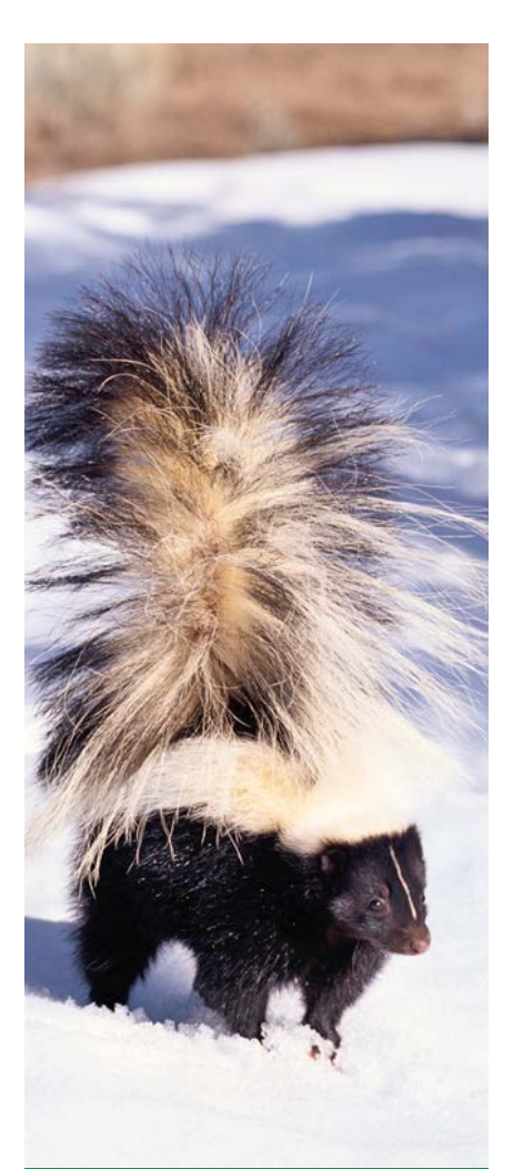
Do You Know?

Skunks sleep during the day. They look for food when the Sun starts to go down. Their worst enemy, the great horned owl, is active at night, too.