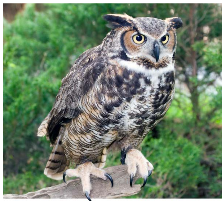
Your bad smell does not keep great horned owls away from you.

Skunks spray dogs that get too close to them. People wash their dogs with tomato juice to help get rid of the smell.