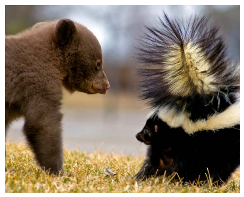
You stand this way when you are getting ready to spray musk.

Sometimes these warnings do not work. Then you spray your enemy